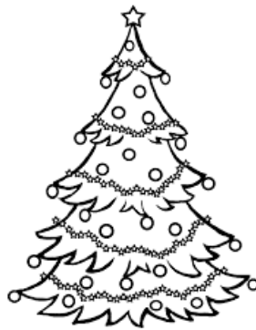
Giant Eagle Gift Cards