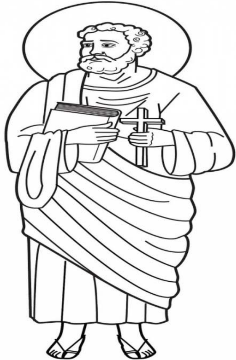
Feast of Saints Peter and Paul - June 29